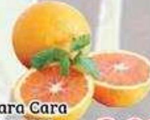
Cara Cara Oranges 3 lb. Bag