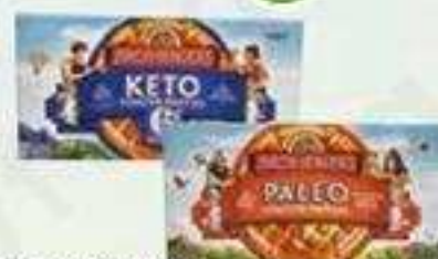
Birch Benders Waffles Assorted Varieties, 5.00-8.25 oz.