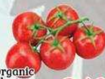
Organic Cluster Tomatoes