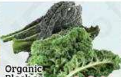
Organic Black or Green Kale