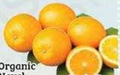
Organic Navel Oranges