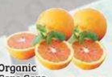
Organic Cara Cara Oranges