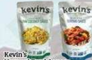
Kevin's Natural Food Sauces Assorted Varieties, 7 oz.