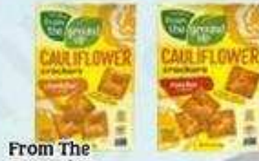
From The Ground Up Crackers Assorted Varieties, 4 oz.