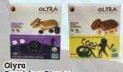
Olyra Breakfast Biscuits Assorted Varieties, 4 ct.