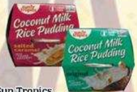
Sun Tropics Rice Pudding Assorted Varieties, 8.46 oz.