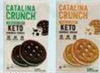
Catalina Crunch Cookies Assorted Varieties, 6.8 oz.