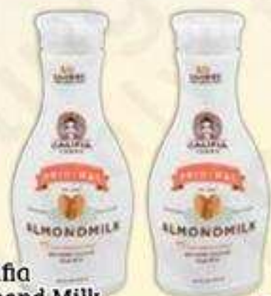
Califa Almond Milk Assorted Varieties, 48 oz.