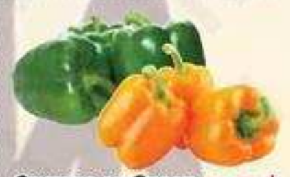
Orange or Green Bell Peppers