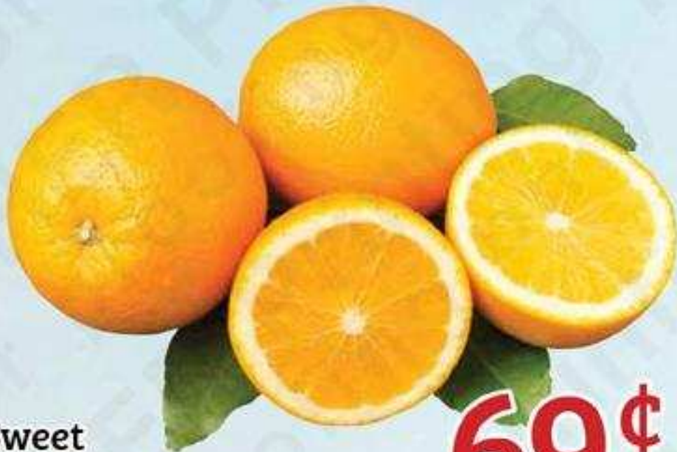
Sweet Navel Oranges

EFFECTIVE: January 12th, 2022 THRU January 19th, 2022