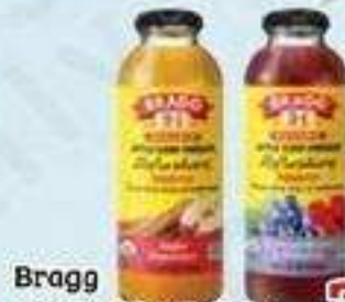
Bragg Apple Cider Drinks Assorted Varieties, 16 oz.