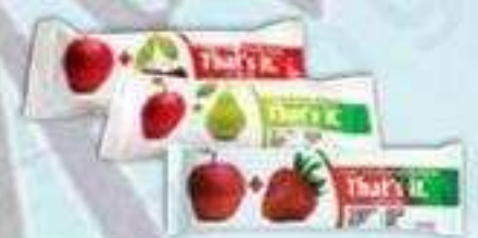
That's It Fruit Bars Assorted Varieties, 1.2 oz.