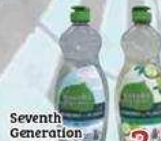
Seventh Generation Dish Liquid Assorted Varieties, 19 oz.