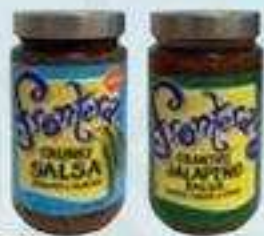
Frontera Salsa Assorted Varieties, 15 oz.