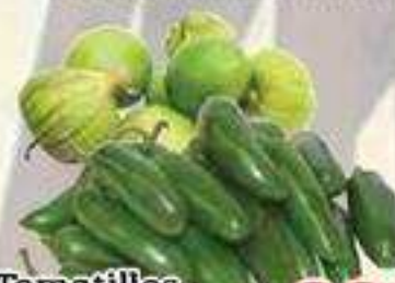
Tomatillos or Jalapeños