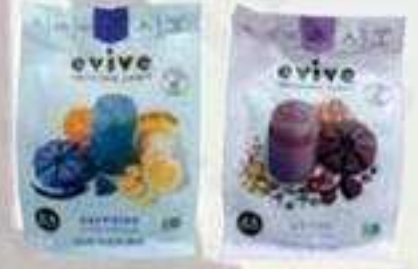
Evive Smoothie Cubes Assorted Varieties, 10.6 oz.