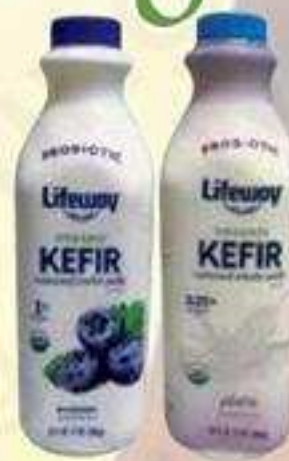
Lifeway Organic Kefir Assorted Varieties, 32 oz.