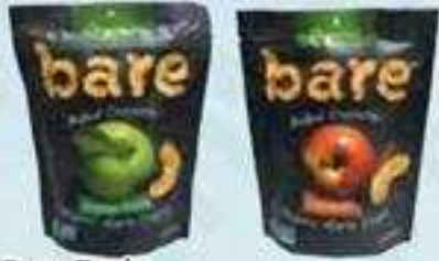
Bare Fruit Chips Assorted Varieties, 3 oz.