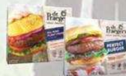
Dr. Praeger's Burgers Assorted Varieties, 10 oz.