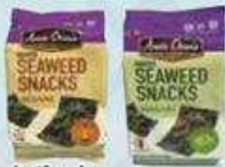
Annie Chun's Seaweed Snacks Assorted Varieties, .35 oz.