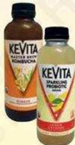
Kevita Kombucha or Probiotic Drink Assorted Varieties, 15.7 oz.