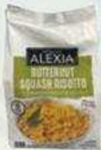
Alexia Risotto & Vegetables Assorted Varieties, 10-12 oz.