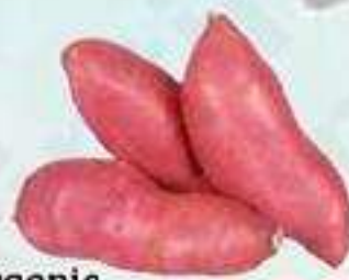
Organic Red Yams