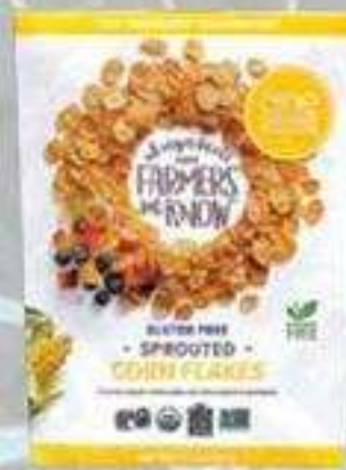
One Degree Cereal Assorted Varieties, 8-12 oz.