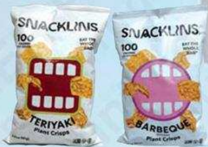
Snacklins Assorted Varieties, 3 oz.