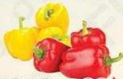
Red or Yellow Bell Peppers