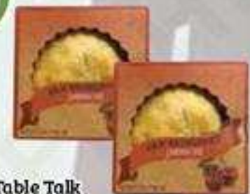
Table Talk Pies Assorted Flavors 4 oz.