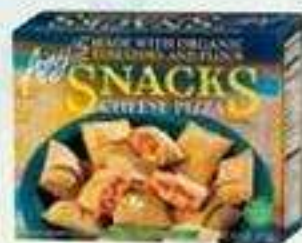
Amy's Pizza Snacks Assorted Varieties, 6 oz.